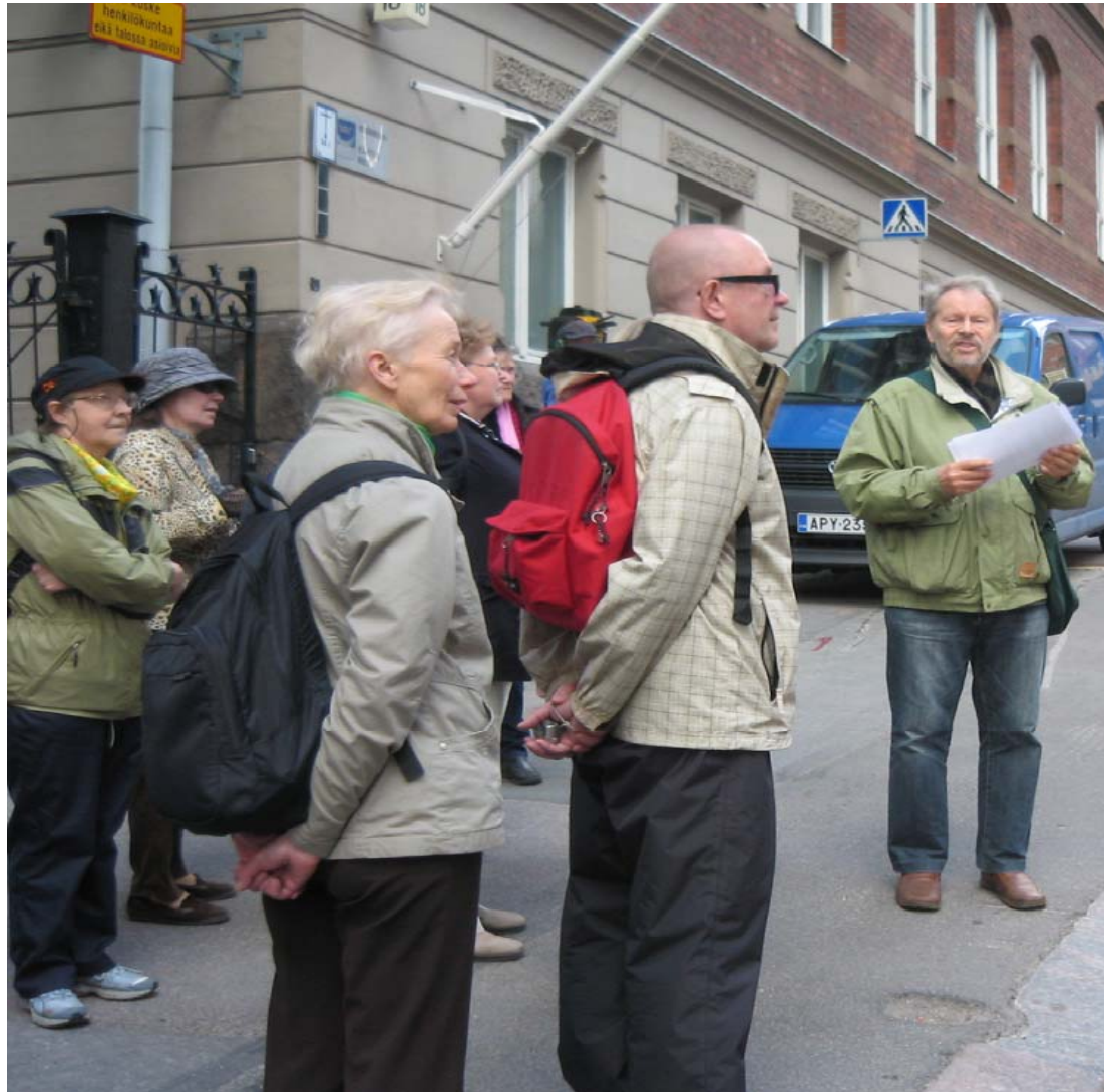
WWCTU World Convention Christian Outreach Workshop