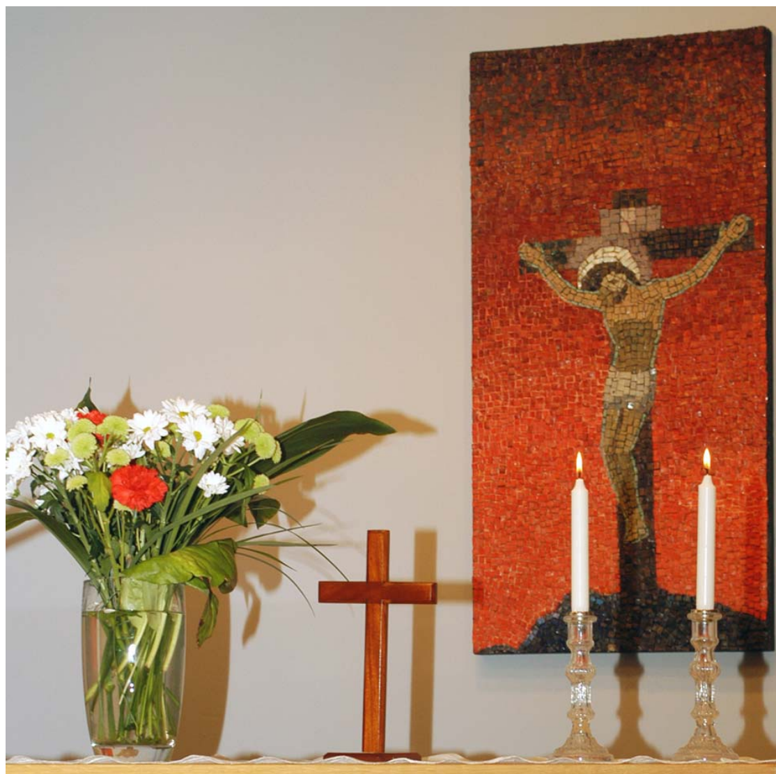
WWCTU World Convention Christian Outreach Workshop